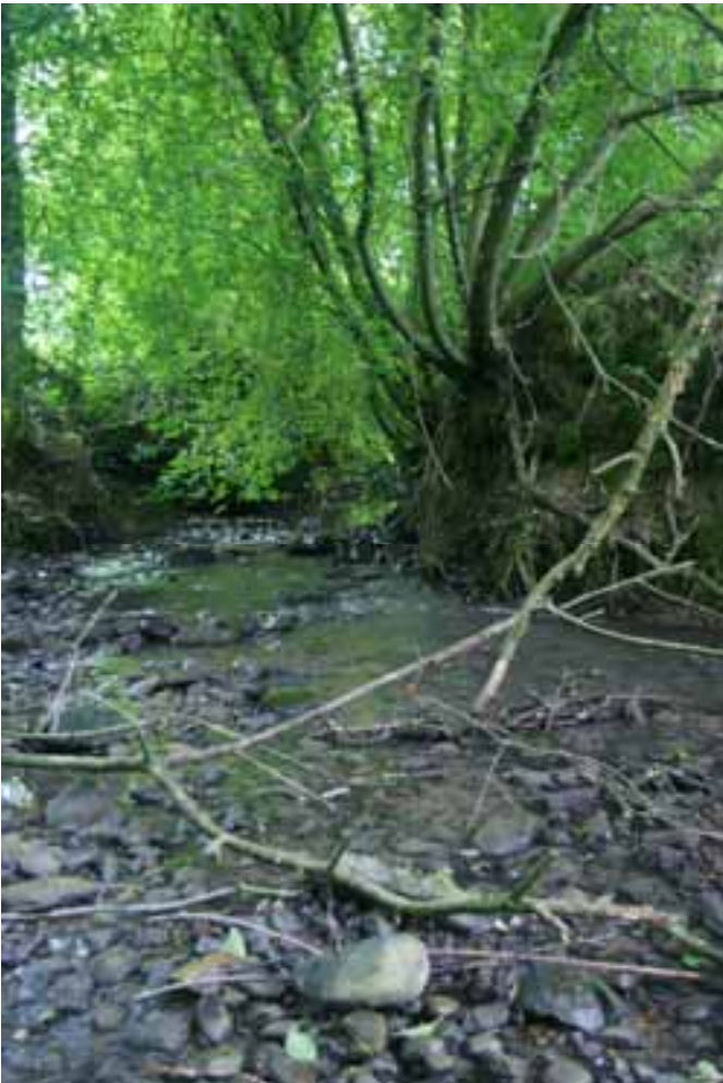
Stream habitat where the orange color form was found.

It was previously known that some specimens of this crayfish species can have a distinct blue coloration. Orange animals, however, have not been observed or caught previously, or so we thought. It turns out that this recently noticed orange color form is just a rediscovery of an unusual, previously mentioned, orange color form. An old Swiss crayfish book makes reference to an orange crayfish species near Kanton Solothurn. Exact locations were not mentioned, however.