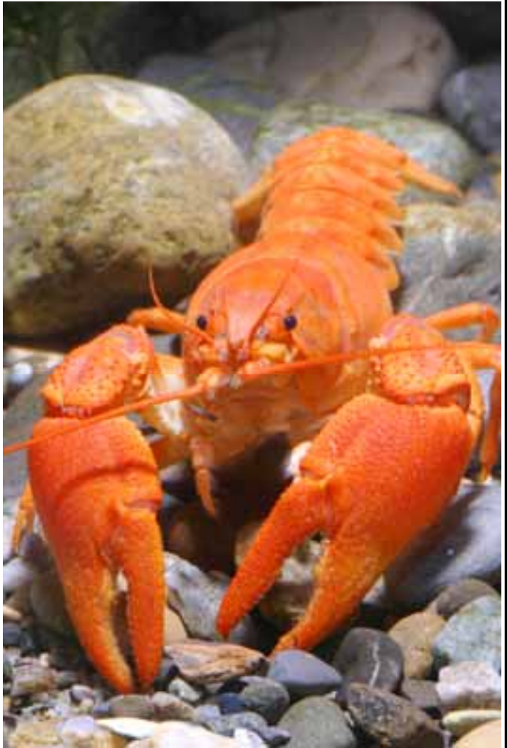
Orange color morph of Austropotamobius pallipes .

When I went down to look at the population myself it took me just 30 minutes to spot several orange individuals, small ones and adult ones. The crayfish are abundant in this small creek and out of 30 crayfish we counted 6 orange ones. The creek is about 1 — 1.5 meters wide and from 10 cm to 70 cm deep. ♪