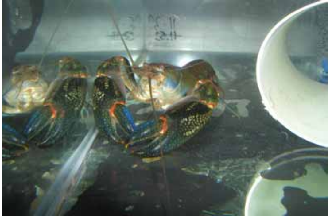
A large male Cherax albidus in the behaviour trial.